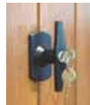
Standard 'T' handle