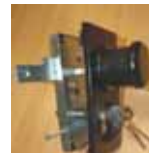
(optional) Cylinder Euro Locking £38