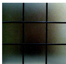
STIPPLED SQUARE LEADING