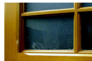
STIPPLED WITH GLAZING BARS