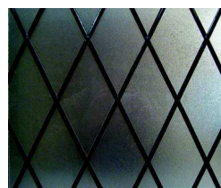
STIPPLED DIAMOND LEADING